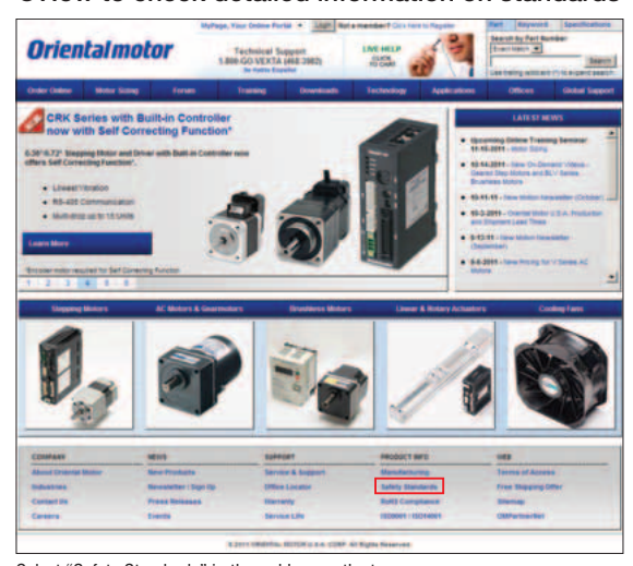
Select "Safety Standards" in the red box on the top page.