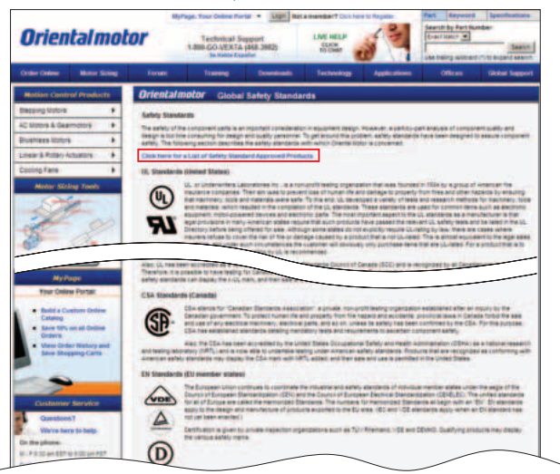
Click on the link in the red box to open the PDF file. Confirm the Safety Standards in the file.